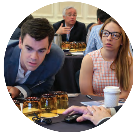
Attendees discuss cases in small group breakouts with faculty.

Save the date for the 2019 AAHKS Spring Meeting taking place May 2–4 at the Crowne Plaza Times Square in New York.